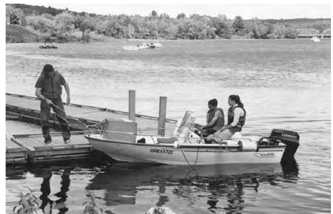
Bowdoin College Coastal Studies Center summer research.

Bowdoin College's Coastal Studies Center (CSC) offers facilities and resources that support student and faculty research, and courses focused on coastal settings and issues. The scope of studies supported by the CSC is inter- and multi-disciplinary including humanities; arts;