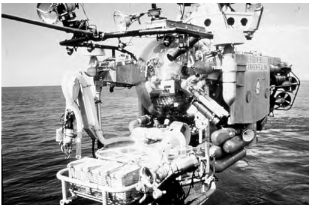
Submersible operated by the Harbor Branch Oceanographic Institution

Contact: Stan Szczytko, sszczytk@uwsp.edu