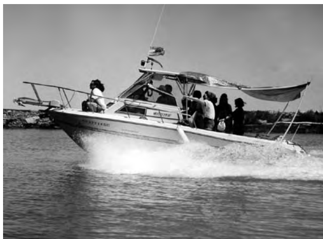
Cal State University East Bay's flagship trailable Research Vessel TELEOST, with an aquatic ecology class on this floating laboratory.