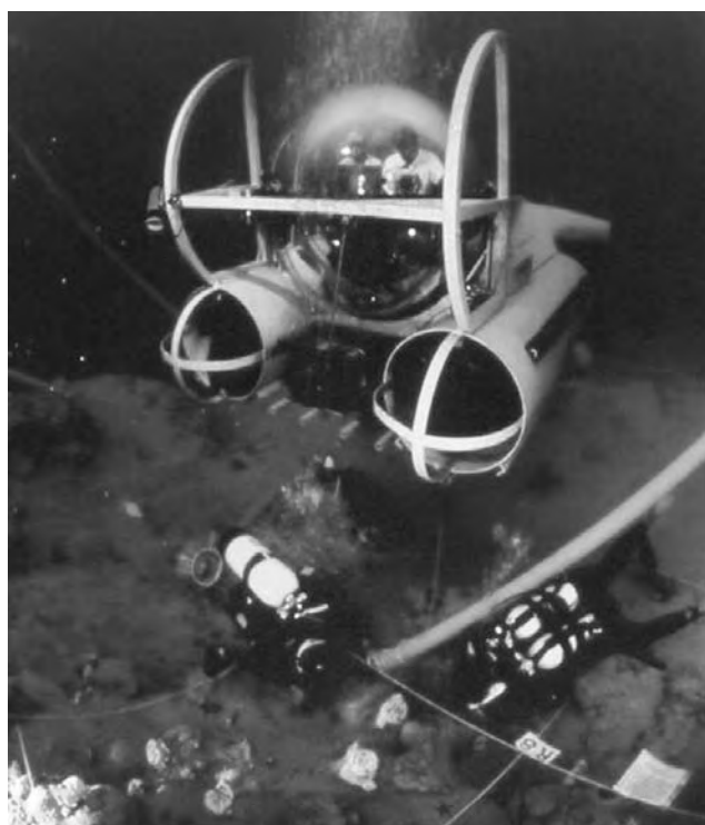
Submersible operated by the Texas A&M University Institute for Nautical Archaeology

Find this Guide online at: http://www.mtsociety.org/publications/