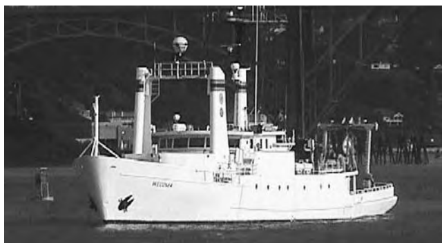
COAS operates the NSF-owned R/V Wecoma out of the Hatfield Marine Science Center in Newport.

Graduate education in the Chemical Oceanography program incorporates course work and research in descriptive, analytical, and theoretical chemistry and in parts of biological, physical, and geological oceanography, reflecting the broad interdisciplinary nature of this field. During their first year, all incoming Chemical Oceanography students take core chemical, physical, biological, and geological oceanography courses with students from other oceanography disciplines. Specialized courses in such areas as isotope geochemistry, advanced thermodynamics, organic geochemistry, radiochemistry, pollution chemistry, and instrumental methods of chemical analysis are subsequently elected to fulfill the curricular requirements and needs of individual students. Students are expected and encouraged to participate in all aspects of chemical oceanographic research, from formulation of initial questions and experimental designs, through development and operation of analytical equipment in the laboratory and at sea, to data analysis and subsequent presentation