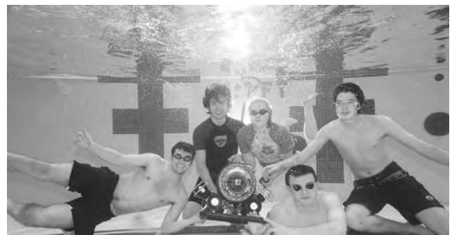
The Polar Submersibles ROV Team gets wet during a practice session in Fairbanks, Alaska.

M.S. candidates concentrate in biological, chemical, fisheries, geological, or physical oceanography. For each of these specializations, students must demonstrate through course work and comprehensive examination both a broad grasp of marine science and detailed knowledge of their specialty. There are no fixed course