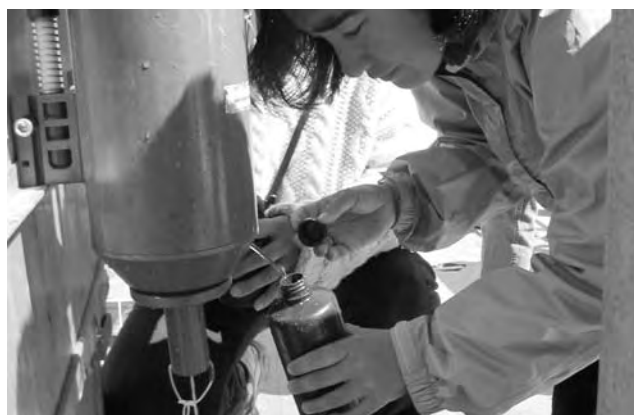
Training ocean educators.