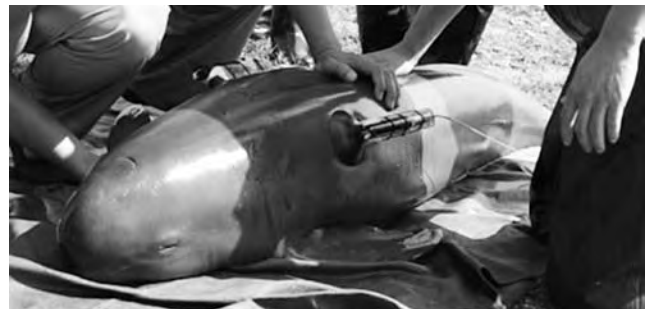
Behavior data logger attached to a finless porpoise