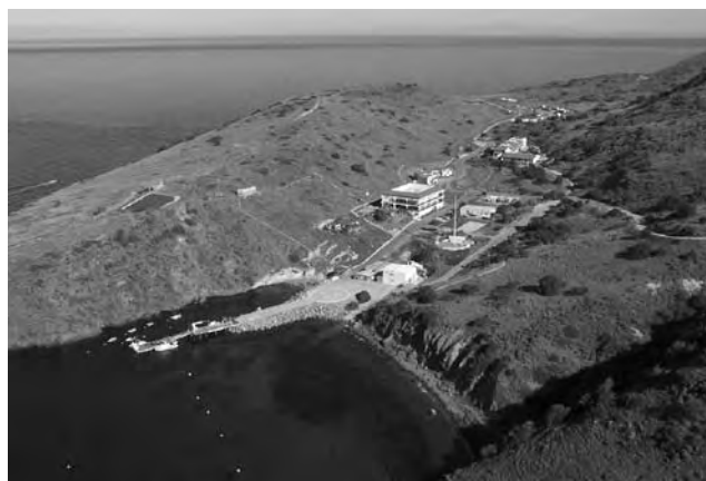
Wrigley Marine Science Center on Catalina Island

The University of Southern California created the USC Wrigley Institute for Environmental Studies to unify and advance USC efforts in environmental education and research. The Wrigley Institute supports a range of research in the environmental sciences, including special initiatives focused on the genetic makeup of marine life and the relationship of microbes to the marine environment. The Wrigley Institute has strong ties to academic departments that offer undergraduate and graduate programs in marine science, such as the Marine Environmental Biology program in the Department of Biological Sciences, and it supports several programs aimed at K-12 students and other informal audiences. These include sci-