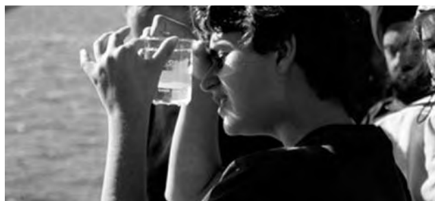
Experiential activities empower learners of all ages to value the ocean as an integral part of the Earth system.

Degree granted: Certificate-Bachelor's degree required