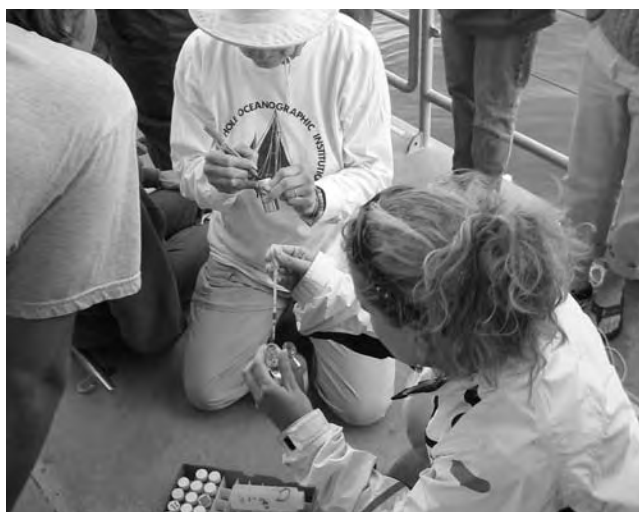
Ocean education training