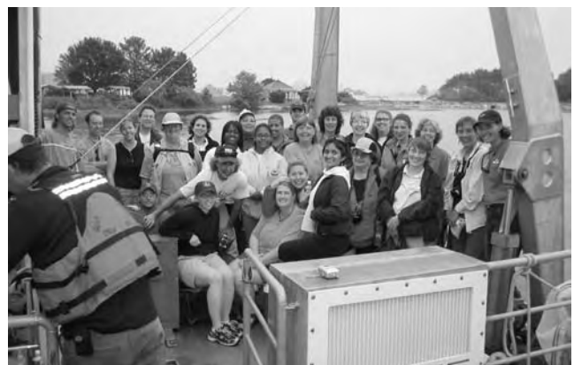
Ocean Observing Educator Institute co-sponsored by University of New Hampshire, Coastal Observing Center and Gulf of Maine Ocean Observing System.

More than ever, responsible decision-making in an age of global awareness requires more information on the environmental consequences of our actions. Decisions based on new information need to be global, cooperative and interdisciplinary if we are to chart a course toward a sus-