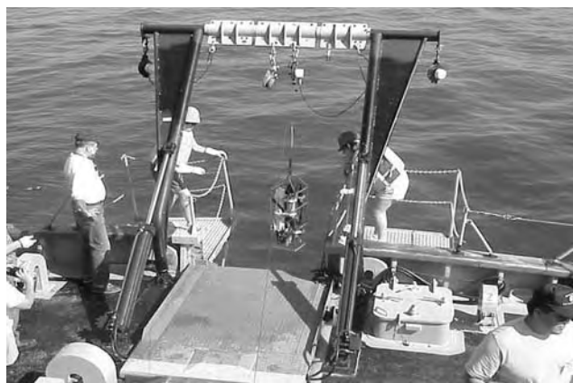
U.S. Naval Academy research vessel