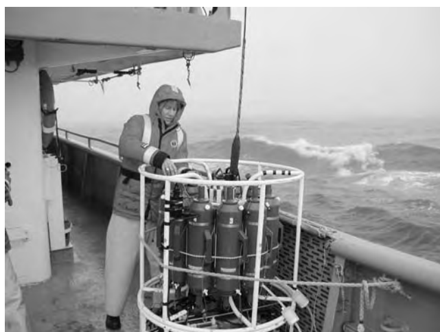
Student intern aboard a research vessel prepares an oceanographic instrument for deployment.