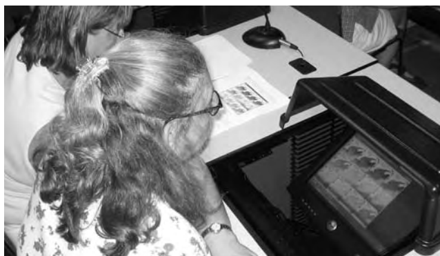
Ocean education training.

Program Website: http://ecology.ucdavis.edu/