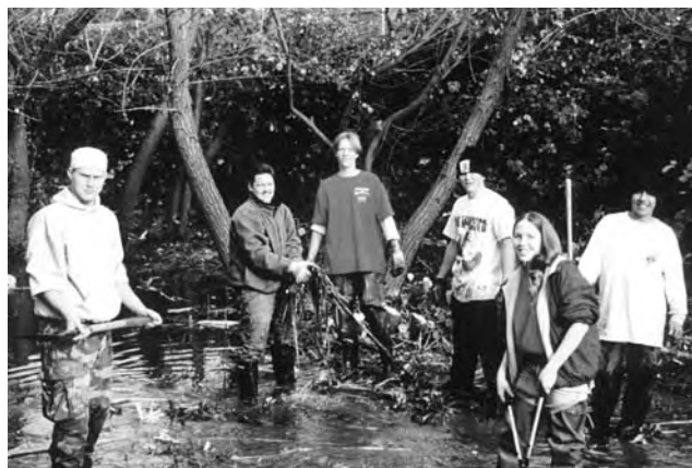
Student volunteers clear debris from Adobe Creek, Petaluma, CA; courtesy NOAA Restoration Center.