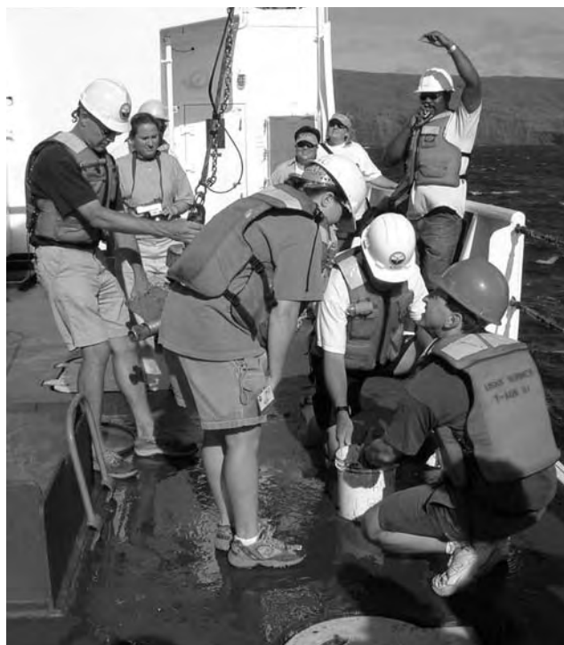
Teachers participating in a University of Southern Mississippi-CO-SEE:Central Gulf of Mexico Sea Scholars Program.

..... You can find a complete version of The Guide to Marine Science and Technology Programs in Higher Education along with other current educational resources and links at the MTS Website: http://www.mtsociety.org .