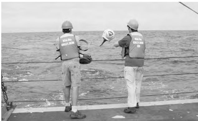
NOAA's Teacher at Sea program