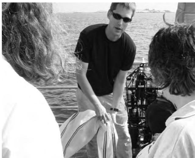
Training ocean educators