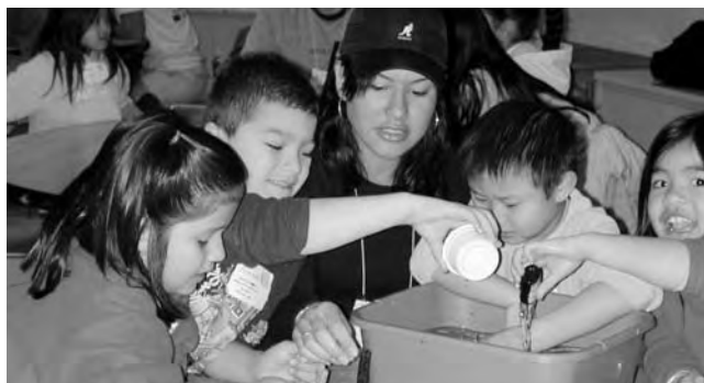
Undergrad and graduate science students learn to teach K-12 ocean science.

Medical University of South Carolina Charleston, SC 29425