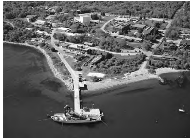
Aerial view of the University of Rhode Island Graduate School of Oceanography; photo by Don Bousquet and Son Aerial Photography.

Facilities: The Department of Ocean Engineering is located in the Sheets Building on the Narragansett Bay Campus, which also houses a marine geomechanics laboratory, a wave/tow tank facility, and faculty offices. The adjacent Middleton building contains office space, a machine shop, an acoustic test tank, an electronics laboratory, and an equipment staging area. The department also has computational facilities on the Bay Campus which include personal computers and SUN workstations. These computers are connected by high speed network to the rest of the Bay Campus, Kingston campus and the Internet. Over 3,000 square feet of laboratory space is available, with equipment specially designed for research and the testing