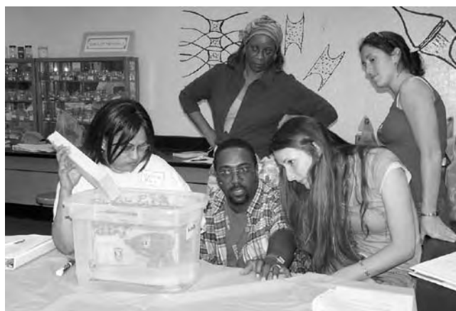
University of Georgia Marine Extension workshop

ary Studies Program. The program of study must contain a Senior Thesis (INTS 4990), which consists of an original project on a topic encompassed by the major.