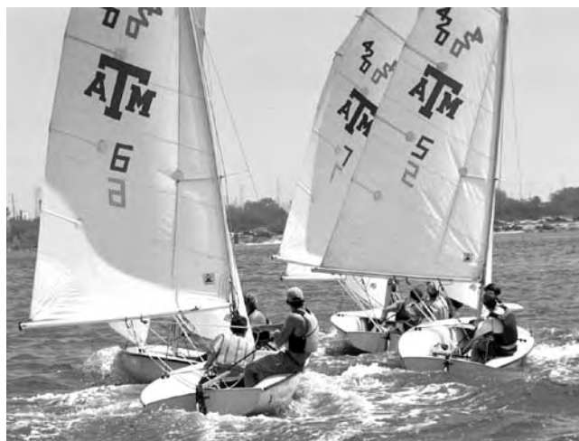
Students at Texas A&M University at Galveston

Faculty: A brief description of all of our faculty and their credentials can be found on at: http://www.tamug.edu/catalog/faculty.html .