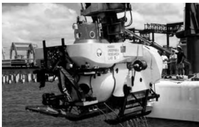
Pisces V submersible operated by the Hawaii Undersea Research Lab