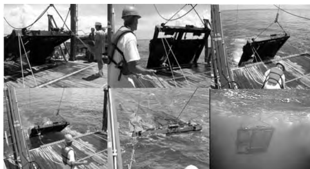
Zooplankton sampling, University of Miami Rosenstiel School of Marine and Atmospheric Science