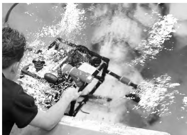
South Broward High School (Florida) launches its ROV above the International Space Station during MATE's 2005 international ROV competition.

Environmental research, impact assessment, planning and management have grown increasingly reliant on computer-based approaches in the past few decades. Geographic information systems (GIS), remote sensing, dynamic-simulation modeling and statistics, for example, are utilized in a variety of scientific and professional endeavors, ranging from forestry, landscape mapping and watershed ecology to archaeology, pollution detection and geology. As a result, the need for professionals trained in technical and applied aspects of these approaches has risen dramatically. Environmental informatics, also called eco-informatics, addresses this need by focusing on analytical and computer-based methods in the study and management of natural resources and the environment.