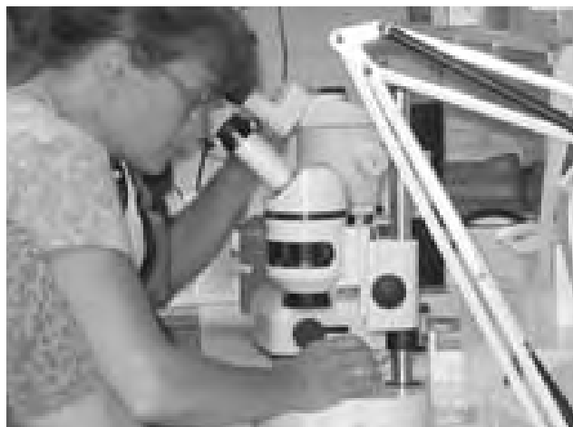
Classroom science teacher inspects a plankton sample in a University of New Hampshire lab.