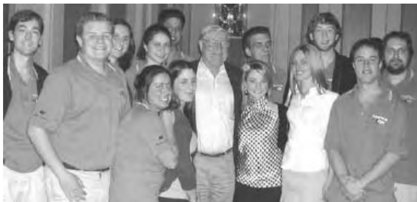
Students from Memorial University in Newfoundland, Canada, who won the 2007 MATE/MTS ROV Committee International Competition met the chair of the MTS Remotely Operated Vehicle technical interest group at the 2007 Underwater Intervention Conference in New Orleans, Louisiana.