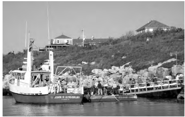
Shoals Marine Lab: Community spirit, environmental awareness and sustainability in action at Shoals Marine Laboratory on Appledore Island, Maine. Every Wednesday at 5:00PM, all students, staff and faculty take a break from their studies to unload food and supplies from the R/V JOHN M. KINGSBURY.

SML sponsors three internship programs for college undergraduates. The eight-week program, Research Internships in Marine Science, is primarily for Cornell and UNH undergraduate biology majors who have completed at least 8 credits of coursework at SML. It pairs undergraduates with research mentors to conduct original investigations in marine ecology, behavior, reproductive biology, parasitology and other fields; results of intern research have been published in Science , Ecology , and The Proceedings of the National Academy of Sciences as well as specialty journals. The four-week program, Island Engineering Internships for Sustainability is primarily for Cornell and UNH undergraduates majoring in civil or