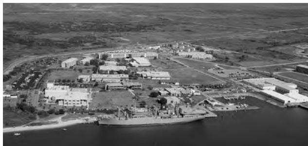
Texas A&M University at Galveston