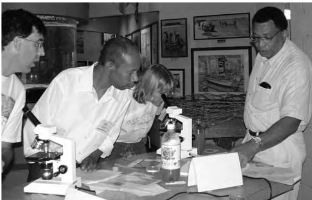
Teachers and scientists studying plankton samples during a COSEE Summer Institute.

Contact: Darlene Tipple, tipple_d@hocking.edu Hocking College 3301 Hocking Pky Nelsonville, OH 45764