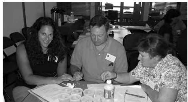
Training ocean science educators; photo courtesy of COSEE: New England.