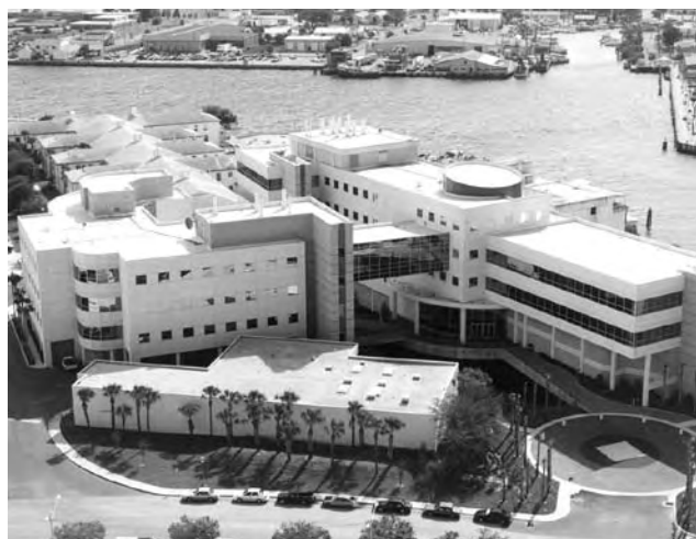
University of South Florida College of Marine Science

Facilities: The CMS is part of the C.W. Bill Young Marine Science Complex. The college's state-of-the art facilities were constructed through model partnerships with state and national marine research organizations. The Marine Science Laboratory, built in 1941, is a two story, 89,370 square foot building, containing research labs, class-